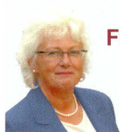
Mariann Fischer Boel

Danish Agriculture and rural development