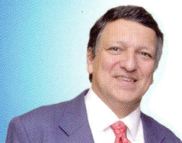
José Manuel Barroso